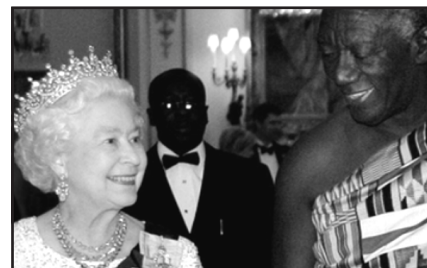
Queen Elizabeth II with former Ghanaian Pres. John Kuffuor.

“There are some 60 nation-states, many of them major states, which presently have monarchical governance, and there are thousands of sub-national monarchs and traditional leaders who give identity, stability, and purpose to their so-